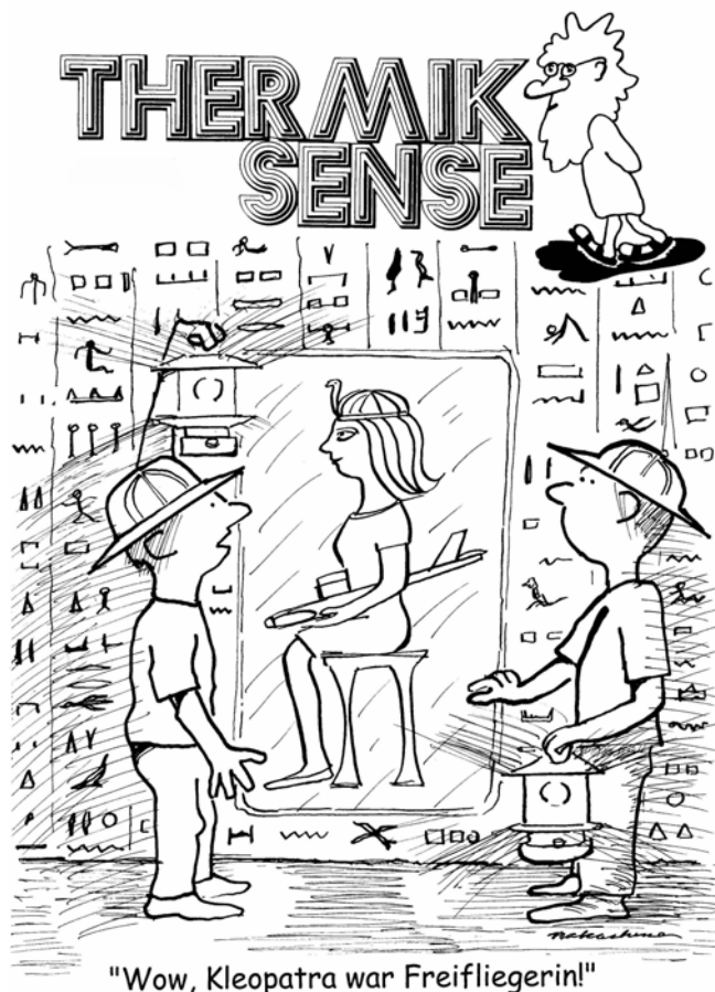
"Wow, Kleopatra war Freifliegerin!"

The circulation figures and total number of pages have continuously increased to over 500 subscribers and 60 pages so far. After reaching a circulation of 200 copies and 34 pages in 1981, the publication figures rose to 230 issues and 50 pages in 1983 before THERMIKSENSE began to comprise 60 pages in 1985 which is still what its average size is today. While its circulation figures rose from 320 in 1985 and 400 in 1987 to 450 copies in 1989, the periodical